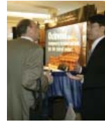
EXHIBIT BOOTH SPONSOR: